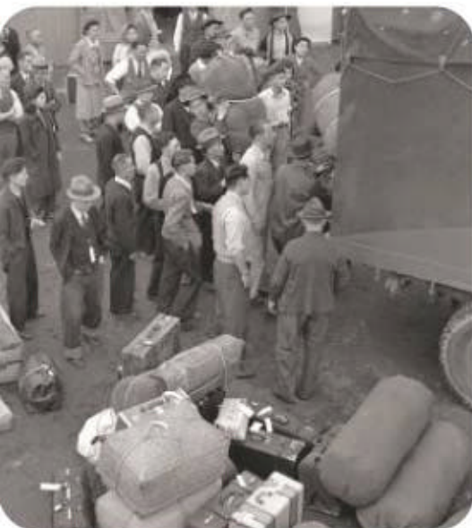
EVACUATED: FDR ordered Japanese Americans into detention camps.