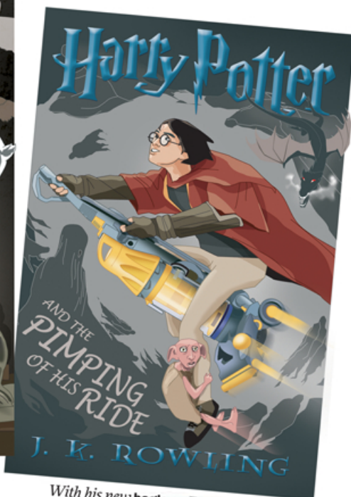
With his new bagless Dyson DC07, Harry has never flown faster, and Gryffindor has never been cleaner!