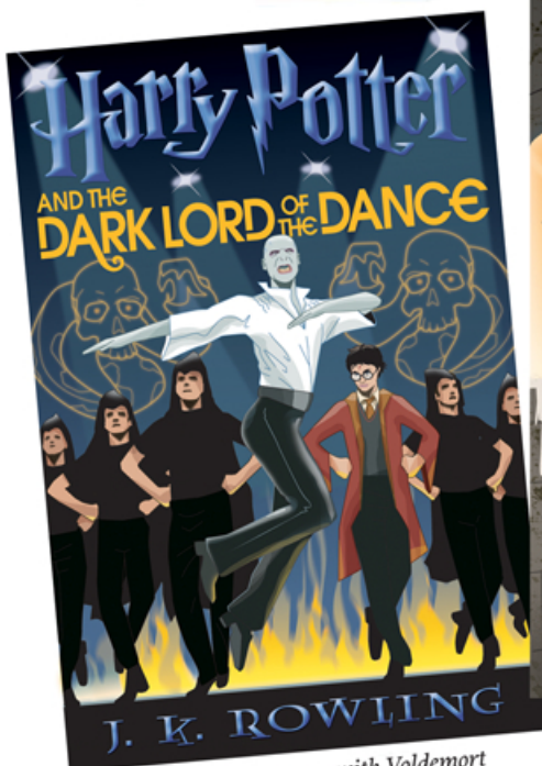
Harry joins forces with Voldemort and the Death Eaters to pursue their real dream: Broadway!