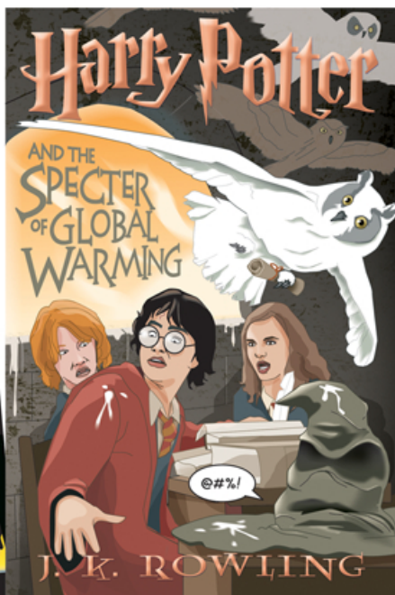
Something is afool at Hogwarts when the Ministry of Magic fines the school for excessive owl emissions