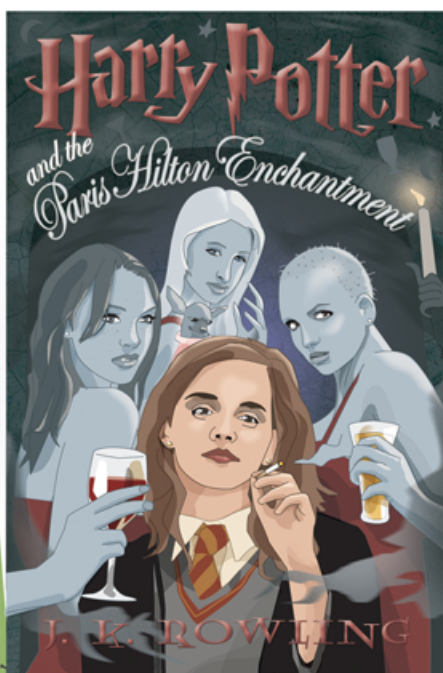
Harry and Ron must save Hermione after she unwittingly falls in with the wrong coven of Dementors